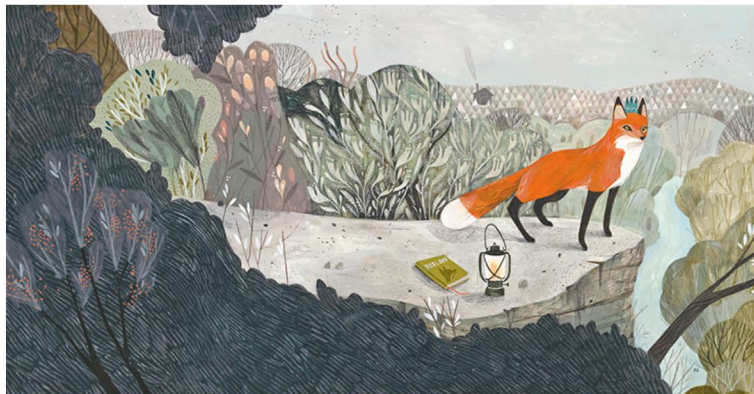
Illustrations by Rebecca Green

These are two illustrations by one of my favorite artists, Rebecca Green. Use your imagination to make up a story about each picture. What's happening in the picture? What happened right before? What's going to happen next?