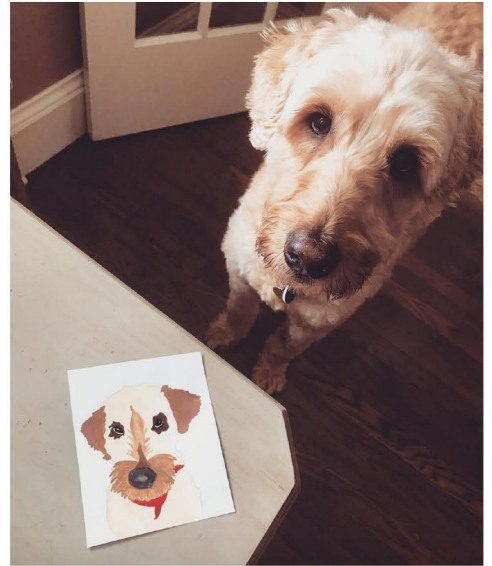
My doggie Sadie!

I would love to see a drawing of your pet, a favorite stuffed animal, or even a super cute animal from your imagination!